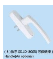
( 8 ) 执手 SS.LD-8005( 可供选择 ) Handle(An optional)