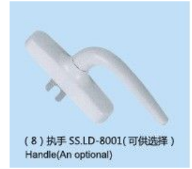
( 8 ) 执手 SS.LD-8001( 可供选择 ) Handle(An optional)