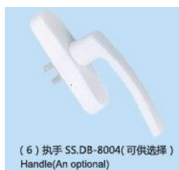
( 6 ) 执手 SS.DB-8004( 可供选择 ) Handle(An optional)