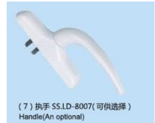
( 7 ) 执手 SS.LD-8007( 可供选择 ) Handle(An optional)