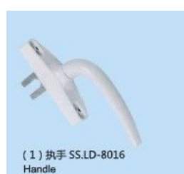
( 1 ) 执手 SS.LD-8016 Handle